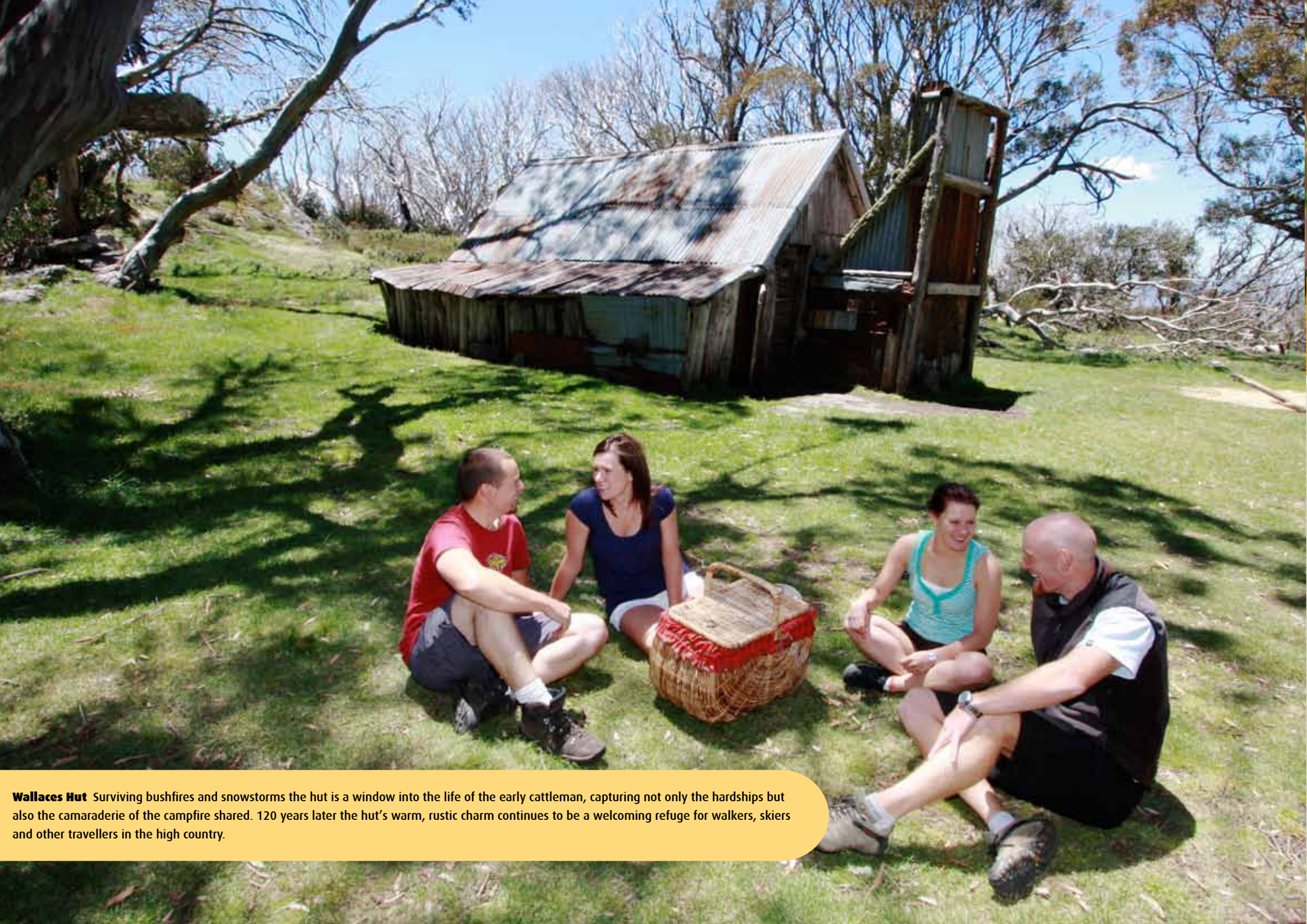
Wallaces Hut Surviving bushfires and snowstorms the hut is a window into the life of the early cattleman, capturing not only the hardships but also the camaraderie of the campfire shared. 120 years later the hut's warm, rustic charm continues to be a welcoming refuge for walkers, skiers and other travellers in the high country.